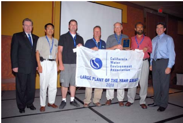
Treatment Plant of the Year (>20 MGD) Central Contra Costa Sanitary District