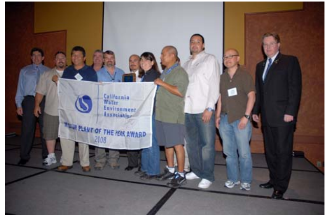
Treatment Plant of the Year (5-20 MGD) Delta Diablo Sanitation District